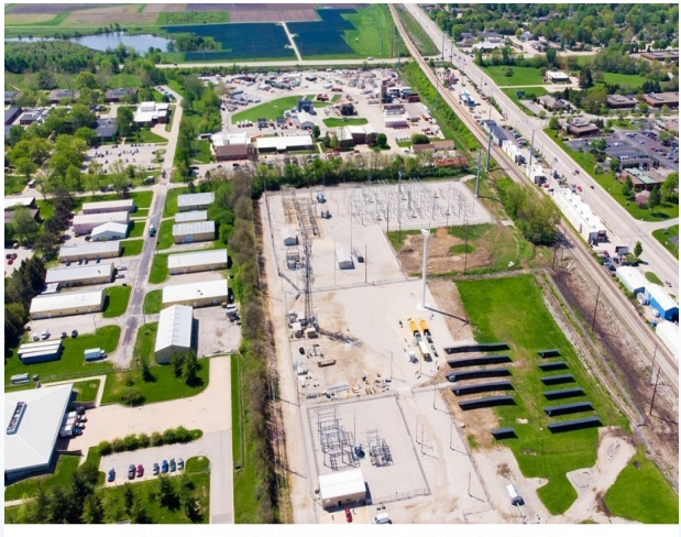
Figure 1. Aerial View of Ameren Microgrid, Illinois

89 % of the Ameren's customers have advanced meters with a bidirectional communication system. Collaborating with S&C Company, Ameren microgrid continuously monitors the power quality to determine the potential impacts of the microgrid on customer power quality, analyzing voltage sags & interruptions, harmonics, flicker etc. at various points in their microgrid using a software model of the existing electrical system provided by Ameren. The Li-ion Polymer based energy storage system (200kW, 500kWh) is used to adjust the VAR (volt-ampere reactive) and watts, that mitigates the power quality issues. This is done automatically when they execute a seamless transition from the grid to island mode and similarly the same system also helps in managing the energy feed from the solar and wind when transitioning back to a grid-connected mode.