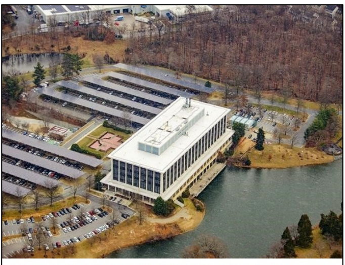
Figure 1. Aerial view of Public Health Safety Headquarters

All critical loads are identified and are powered from a separate diesel generator. Project control system and server are equipped individual UPS (Uninterruptible Power Supply) units to provide backup power until generator system is online. Standby natural gas generators (2 x 1MW) and CHP (0.8MW) are sized to provide power to the entire building (max building load is 1.9MW). The 2.8MW generators are powered via