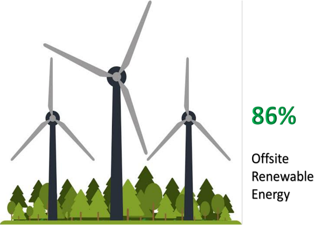
Figure 2. Percentage of renewable energy

In alignment with PEER's standards, the facility meets 86% of its power requirement from offsite renewable power. Additionally, the project has installed a rooftop solar PV capacity of 50 kW. All these measures have helped the project in a cost savings of INR 12 million ($182,273) and mitigating 7 kilotons of CO 2 emissions.