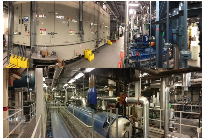
Figure 1. Gas turbine, Heat recovery steam generator and boilers inside the Main campus Energy building