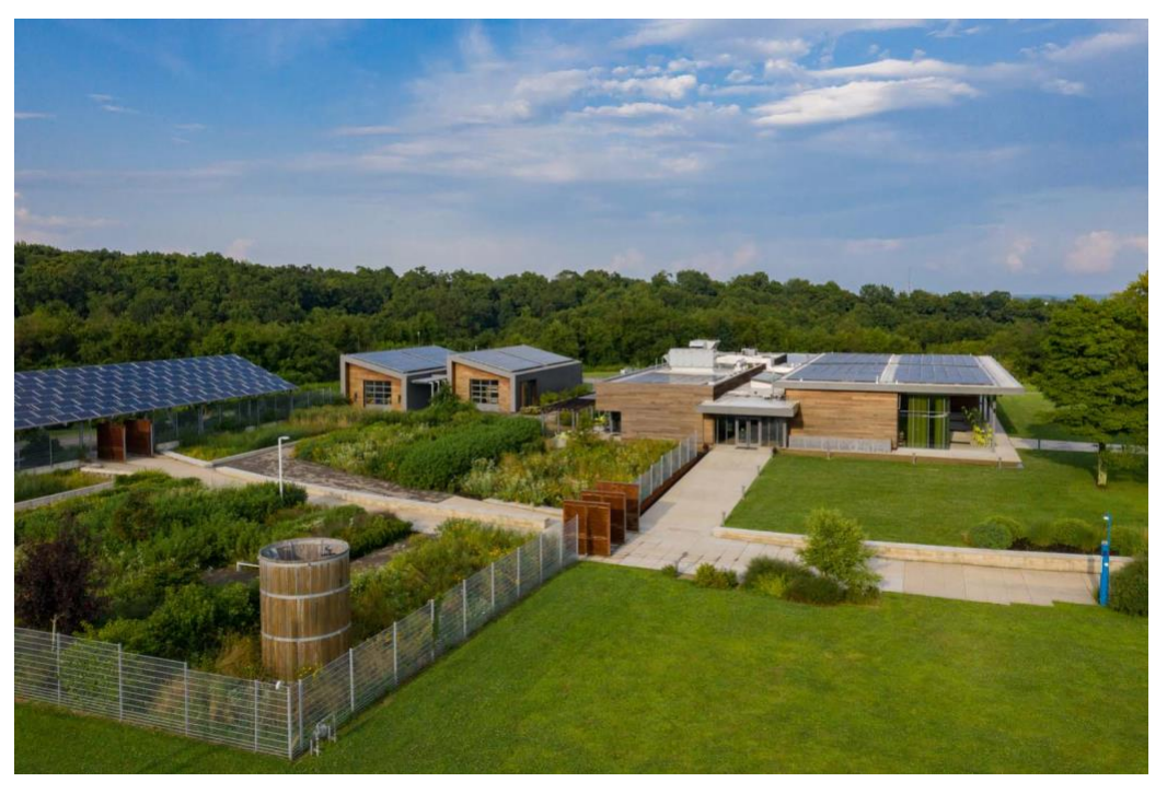
Figure 2: Aerial view of solar PV panels installed at Eden Hall Campus, Chatham University

Through its rating system , PEER emphasizes renewable energy uptake and storage technologies for campuses to reduce their environmental impact and minimize losses associated with their operations.