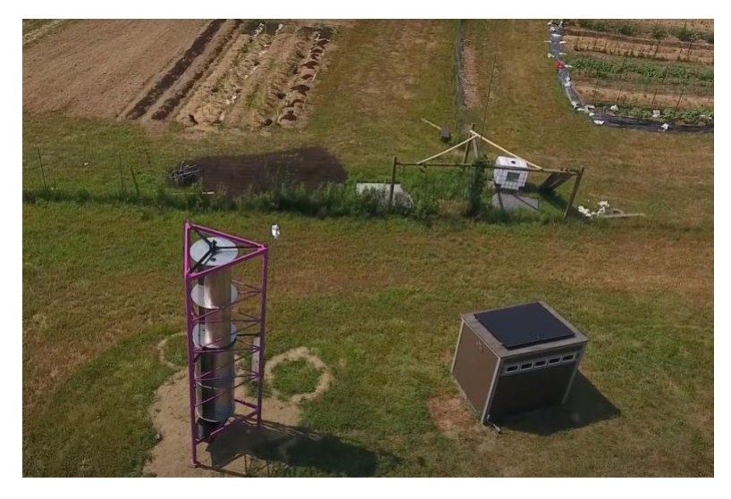
Figure 2: Microgrid with Windstax Vertical Axis Wind Turbine, Solar PV, and Battery Storage.

The Eden Hall Campus also owns a 2.5kW microgrid system with two solar PV panels (1.5kW) and a vertical axis wind turbine (1kW), supported by the mobile BESS in its Elsama Field (as shown in Figure 3). This microgrid can generate power to feed their outdoor classroom and can support their farm needs. Presently the microgrid is only tied into the Windstax turbine and solar panels, but the campus envisions that it will become a testing ground for alternative energy sources.